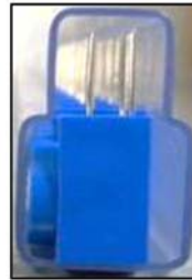
New Tube Packaging